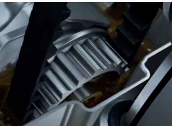
Ford EcoBoost 1.0 litre gasoline engine, with timing belt running in oil.

chain. The chain and sprockets were removed, and the engine modified to take a timing belt. The engine was re-characterised. Lower friction was measured for the belt system, which would deliver 0.48 to 1.13% higher fuel efficiency and lower CO2 emissions by 1.45 g/km. It was impressive, as this was a lab system, not a highly optimised and developed arrangement. In contrast, a recent paper by Hyundai/Kia and Borg Warner optimised the timing chain for low friction, and were able to improve fuel efficiency by only 0.4%. FEV also found that the noise emitted by the chain or belt meshing with the cam sprocket/pulley was over 15 dB higher at 2000 rpm for the chain than the belt. The overall engine noise was up to 5 dB quieter with the timing belt.